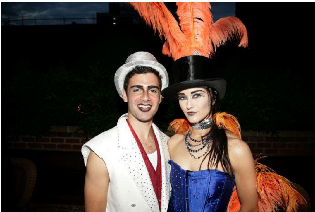
Broadway in South Africa