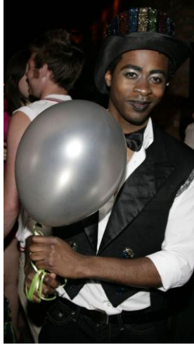
Circus atmosphere at The Bowery Hotel